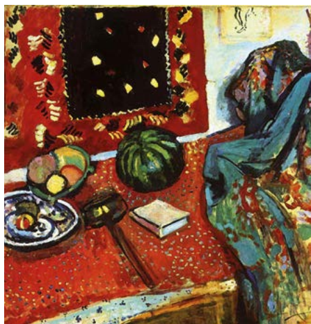
On the cover: Graphic elaboration of a detail from Still Life with a Red Rug (1906) by Henri Matisse; private collection