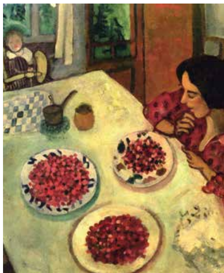
On the cover: graphic elaboration of Strawberries. Bella and Ida at the Table (1916) by Marc Chagall; private collection